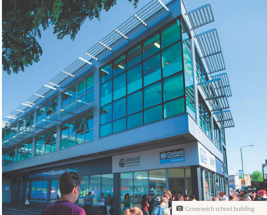
📷 Greenwich school building

** (Supplements and minimum numbers may apply)