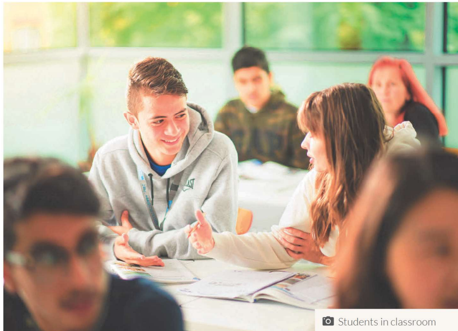
📷 Students in classroom